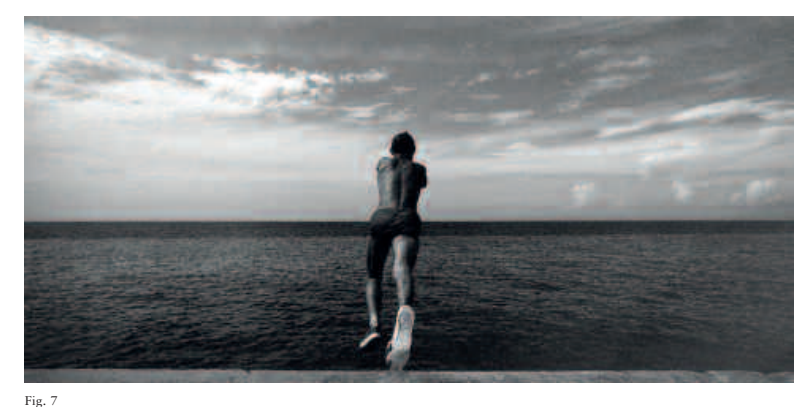
Fig. / Manuel Piña, Untitled, from the series Aguas Baldías, 1992–94. Digital C-print, 48 x 103½ in. Collection Pérez Art Museum Miami, gift of Jorge M. and Darlene Pérez.

engaged by contemporary Caribbean visual artists encourage a recognition of unexpected mirrorings and inevitable unities across Caribbean spaces and bodies.