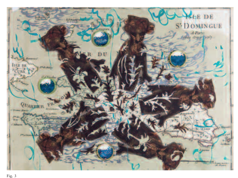
Scherezade Garcia, In the garden of dictators / it is raining caudillos I, 2015. Archival inkjet print, collage, charcoal, watercolor, ink, plastic toy on paper, 22 x 30 in.

that continues to this day; Christopher Columbus originally designated those known to us as the Lesser Antilles or Windward Islands as the "Cannibal Islands," and Spanish conquistadores referred to the islands around Aruba, Curaçao, and Bonaire—today the Leeward Antilles or ABC islands—as the "Useless Islands" for their lack of lucrative natural resources. These geographic designations favored the larger islands or Greater Antilles, comprising Cuba, Jamaica, Puerto Rico, and Hispaniola. When it was not outright forgotten, the Caribbean archipelago—named the Archipelago of Mexico in a series of maps—was subsumed into a continental narrative.