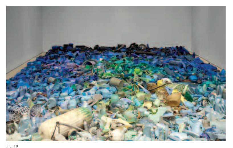
Tony Capellán, detail of Mar invadido , 2015. Found objects from the Caribbean Sea, 360 x 228 in. Installation view at the Pérez Art Museum Miami.

Puerto Rico, through meticulously rendered straight lines (fig. 8). The horizon focuses our attention on the borders that divide and mark off land, as well as on the movements that circulate across the currents of sea and air. It also captures the yearnings and uncertainties that exist in the liminal, relational spaces between islanders, looking outward across the seas. This looking point to moments of self-similarity between insular spaces and island bodies and an archipelagic world that reveals itself through a horizontal logic of connection, similarity, and analogy.