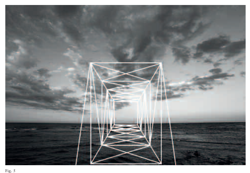
Fig. 5 Fausto Ortiz, Approaches , from the series Exodus , 2013. Digital photograph, 20 x 30 in.

each other. A center-periphery paradigm-with the seats of colonial and neocolonial power understood as the "center" and the Latin American countries as "peripheries"-has dominated discourse, revealing a constant preoccupation to measure the region's artistic production against hegemonic standards.21 The Caribbean (island) often becomes precisely what a modern "Latin America" strives to define itself against-hence the Venezuelan artist Alessandro Balteo Yazbeck's bold declaration, "If the grid is the new palm tree of Latin American art we are making progress."22 Revealing a decidedly Eurocentric perspective, the quotation celebrates the move away from seemingly backward insular tropes, such as the palm tree. In so doing, however, it avoids the ways in which Caribbean realities challenge received understandings of modernity as a movement toward "progress," resulting in formal purity and homogeneity. In the words of Sibylle Fischer, "If we read modernity from the perspective of