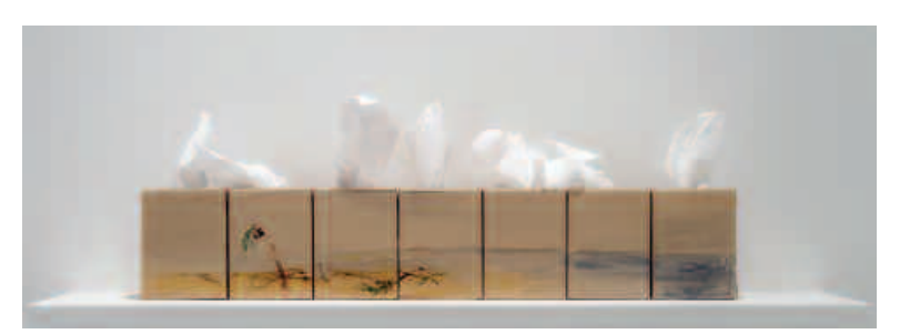
Fig. 9 Frances Gallardo, Untitled, from the series Landscape, 2012. Watercolor on cardboard, tissue paper, 4\% \ge 31\% \ge 5 in. Courtesy of the artist.

Tony Cruz, Distance Drawing from San Juan to Bogota: An attempt to draw the distance from San Juan to Bogotá (1763 km). Realized only 9.132 percent (1610 m), 2012. Pencil on wall, 24 x 108 in. Courtesy of the artist.