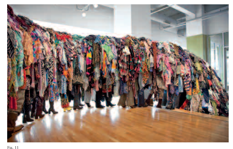
Fig. 11 Guerra de la Paz, detail of Follow the Leader , 2011. Sculptural installation, variable dimensions.

In Representational Acts, artists take up representation as an active process rather than a passive translation of the visible world. As opposed to the mimetic function associated with representation in traditional art history,