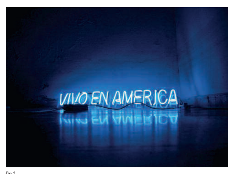
Karlo Andrei Ibarra, Continental , 2007–10. Neon powered by solar light, 6 x 36 in.

Not America" superimposed over a map of the United States and concludes with a map of the hemisphere's continental landmasses with the word "America." The Puerto Rican artist Karlo Andrei Ibarra, in a work tellingly titled Continental (2007-10), ironically reminds his viewers that Puerto Rico is both part of the American continent and the United States by displaying the sentence "Vivo en América" ("I live in America") in neon lights (fig. 4). The Hispanophone islands strongly identify with the notion of "Latin America," so much so that it was the Cuban intellectual José Martí who wrote one of the most fundamental documents articulating an Americanist identity, the treatise "Our America" (1892).20 Today's popular music from the Hispanic Caribbean is full of invocations to continental Latin America in such songs as Calle 13's "Latinoamérica" (2010) and Gente de Zona's "La Gozadera" (2015). In